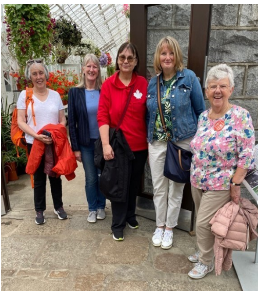
At the David Welch Winter Gardens with members of SI Aberdeen