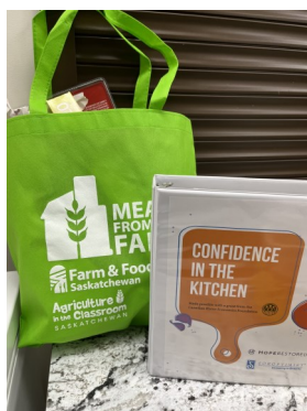
Resource Kit and Binder