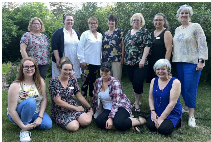
SI Saskatoon members celebrating the club year