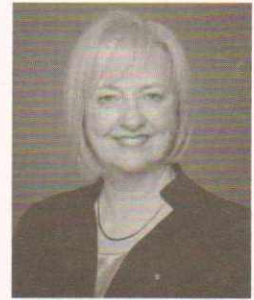
Joy Smith , B.Ed., M.Ed. Member of Parliament Kildonan-St. Paul