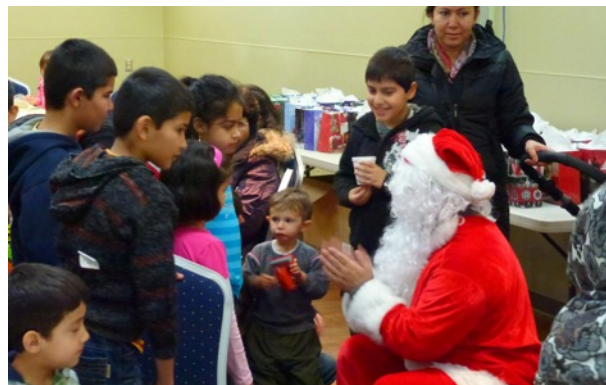
Visit from Santa!

And in December, instead of a regular business meeting we had our Christmas pot-luck and wrapping session where we wrapped gifts for two low-income families with a total of 12 children and stuffed ourselves with delicious food. What fun!