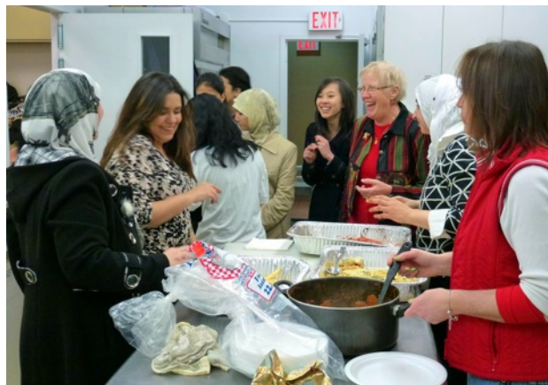
The kitchen is a busy place! SITC members, friends and teen volunteers serve a multicultural Christmas dinner to our guests at the Coquitlam Warm Place for Women.

Every month, year-round, we hold two Warm Place for Women evenings. Soroptimist members prepare and serve dinner to up to 60 low-income women and children each time. Always there are piles of donated clothing, brought to us by community supporters. And we have helpers! A group of kids come from Anmore Elementary to help at the Port Coquitlam dinners the first Thursday of every month. And in Coquitlam, on the third Thursday, we have the assistance of a group of teen girls from Pinetree Secondary and other young women recruited by our members. Christmas dinners in both locations were especially fun evenings. At the Coquitlam location which serves a large number of refugee families from Afghanistan (lots of kids), we had a visit from a Fari-speaking Santa!