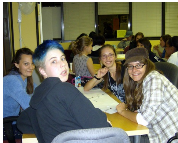
Some of the girls at the beginning of the Totally Beautiful program.

There are 6 two-hour sessions over a 3 month period with each session including dinner, socializing, activities, and group discussion. At the end of each session the group members share their plans for the weekend. The primary focus of the 6 sessions is to enhance the social skills of all the young women allowing the target group to gain confidence and competence in their personal presentation leading to more inclusion in their school, workplace, and community. With increased self confidence, self worth each of these young women are less likely to be exploited, isolated and at-risk.