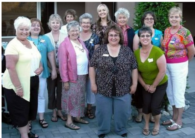
SI Osoyoos board members and guests.

SI Osoyoos wrapped up the club year with dinner and Installation of the Board on Tuesday June 21st. Four members from SI Okanogan Valley in Washington State (our friendship link), came up for the evening, and did a wonderful job of installing our new board.